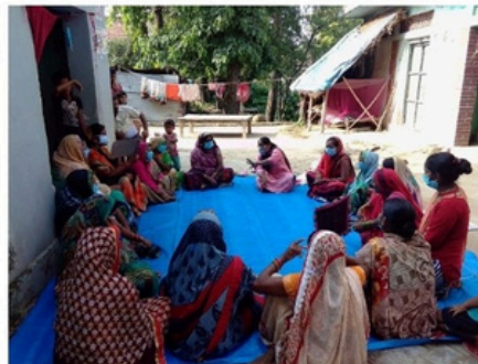
Meeting with community