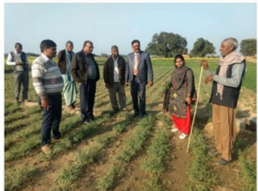
Field visit by agriculture scientists