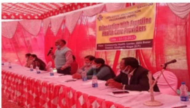
Orientation with frontline health care provider and community Health Worker at Uska Bazar CHC