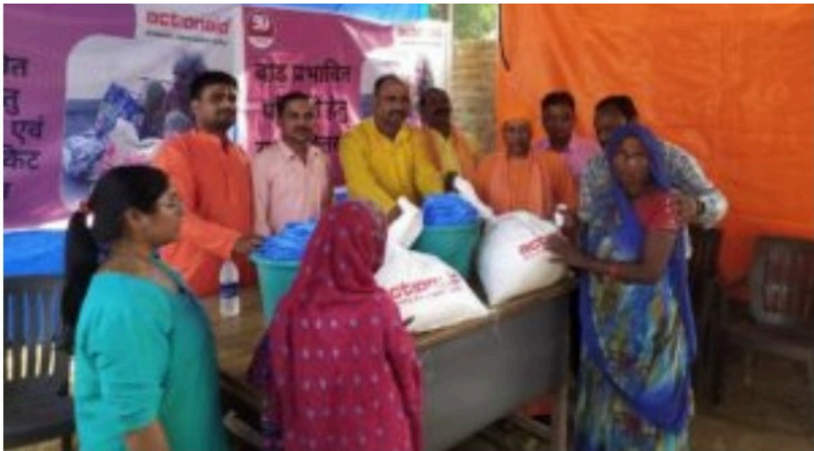
Distribution of Flood Relief material by MLA

Swabhiman Samiti provided flood relief in Siddharthnagar, distributing food and hygiene kits to 190 affected families. The support came through ActionAid Association, helping those who lost livelihoods due to floods.