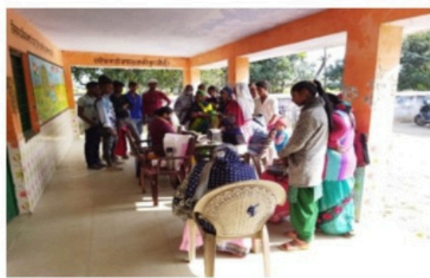
Village level vaccination Camp