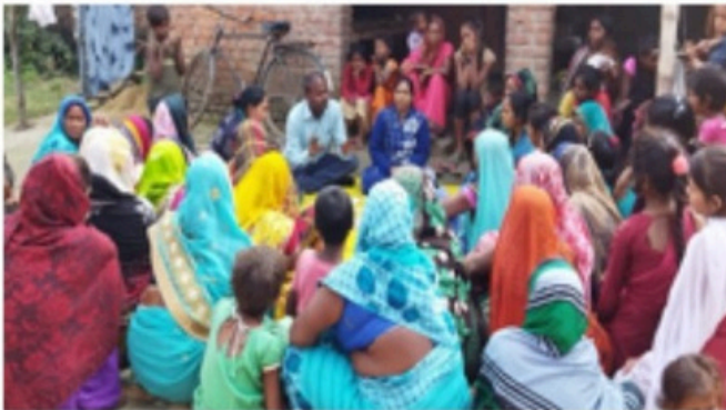
Village level Meeting with parents