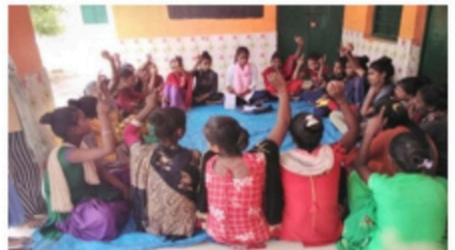
Conduct CSE session with adolescents