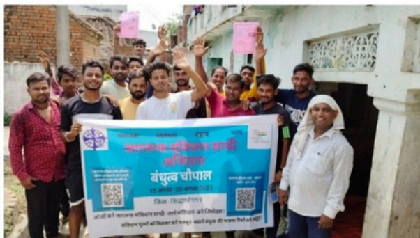
Prabuddh Chaupal Abhiyan

Family covered: 350 directly, 1000 indirectly.