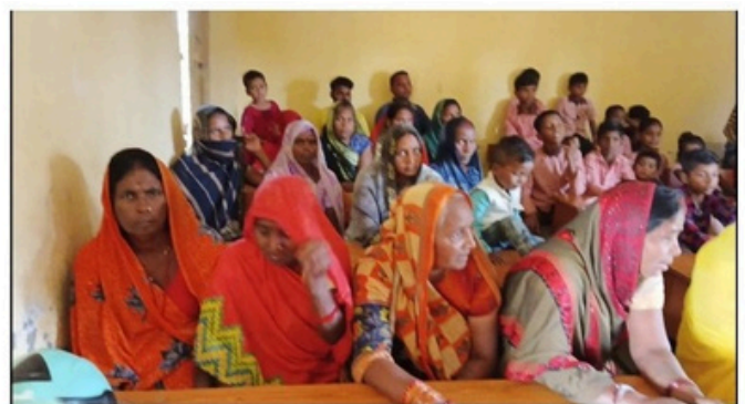
Meeting with parents