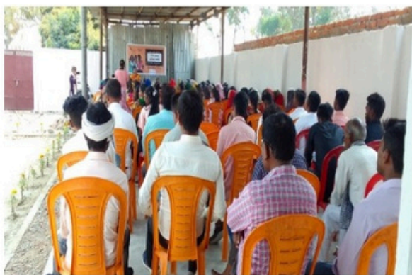
Meeting with community and parents

Through the facilitation of these “influencers” and the support of Panchayats, SMC members, communities and others concerned, the Swabhiman Samiti has so far been able to identify nearly 142 out-of-school children from the Uska Bazar block of Siddharthnagar district.