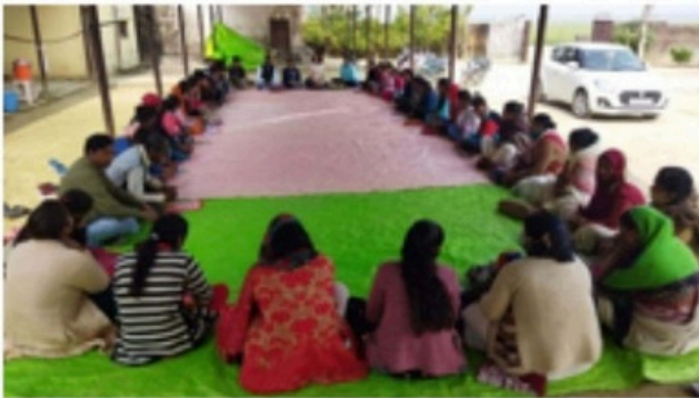
Meeting with staff & Peer Educator