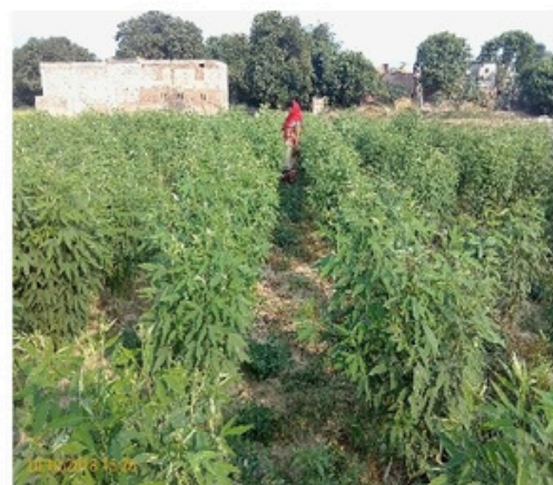
Arhar cultivation with intensification methods and kneeling.