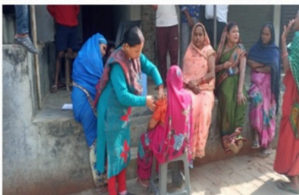
Door to door vaccination drive