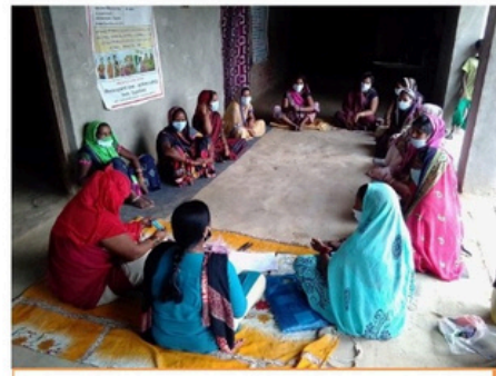
Meeting with community