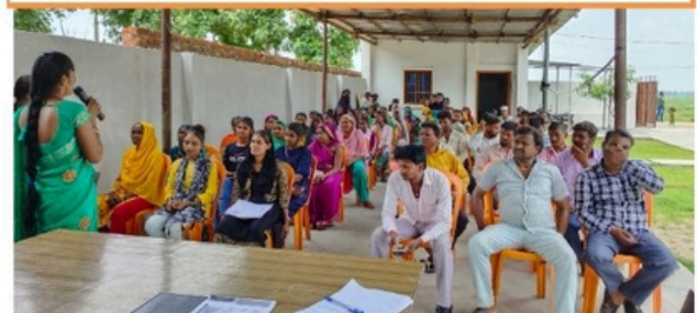
Joint meeting with men and women