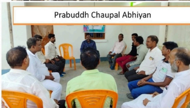
Meeting with Staff