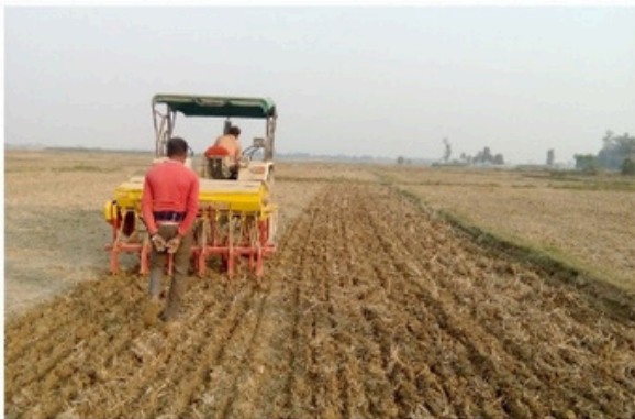
Wheat line sowing with seed driller

This initiative empowers farmers by promoting sustainable agriculture practices. Objectives include optimal resource use, low-water crop cultivation, cost reduction, and income diversification. It also establishes links with government departments for broader agricultural development.