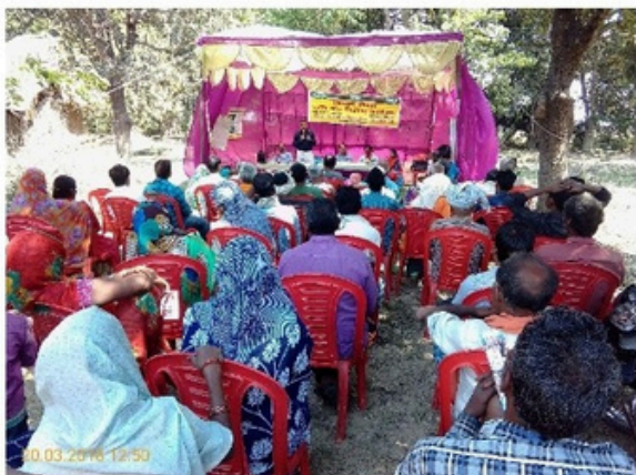
Meet with expert programme